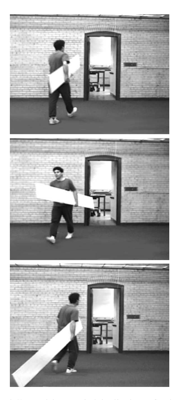
Fig. 1. Triad example. Upper panel: the agent carries the board into the room. Central panel: the agent carries the board out of the room. Lower panel: the agent drags the board into the room.